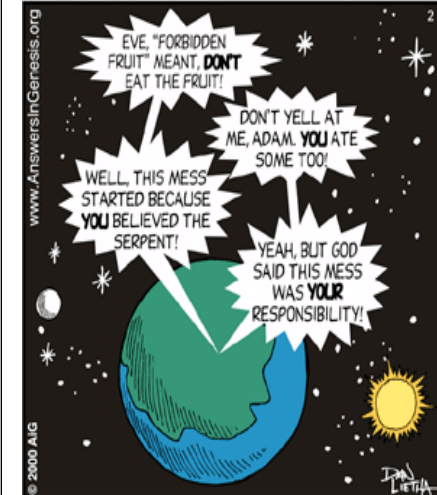
The actual First World War