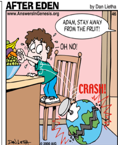
The making of an ideal Genesis “teachable moment”.